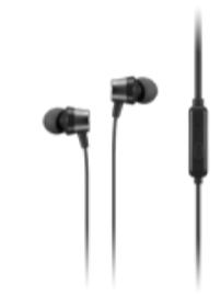
Lenovo Analog In-Ear Headphones Gen II Bulk Package (20pcs)